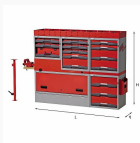
5006 E5 - Assortment for left side