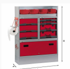
5006 EF1 - Assortment for right or left side