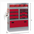
5006 EF1 - Assortment for right or left side