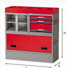
5006 EF6 - Assortment for left side