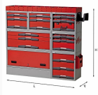
5006 E8 - Assortment for left side