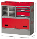
5006 EF6 - Assortment for left side