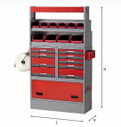
5006 E9 - Assortment for right side