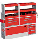
5006 C4 - Matrix - Assortment for left side