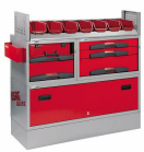
5006 C3 - Matrix - Assortment for left side