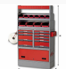
5006 E9 - Matrix - Assortment for right side