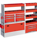
5006 C5 - Matrix - Assortment for left side