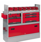
5006 EF2 - Matrix - Assortment for left side