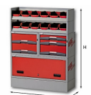
5006 E4 - Matrix - Assortment for right side