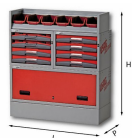
5006 E11 - Matrix - Assortment for right side