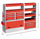
5006 C5 - Assortment for left side