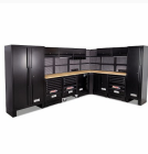
516 SA/CTL - Workshop furniture with wooden top