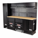
516 SA/STL - Workshop furniture with wooden top