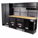
516 SA/PRL - Workshop furniture with wooden top